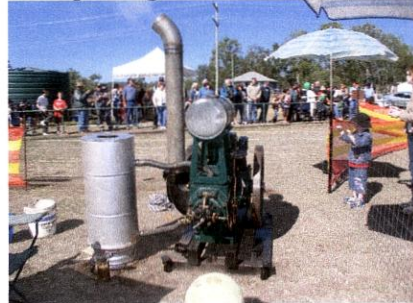
Kevin Dieperink's vintage engine display.