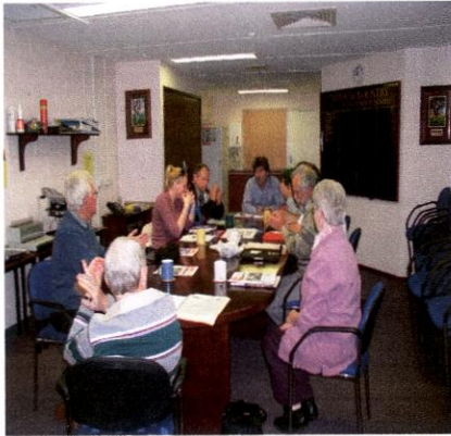
One of the council meetings in Rosewood.