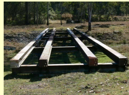
We'll cross it soon