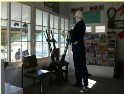
SM on Duty