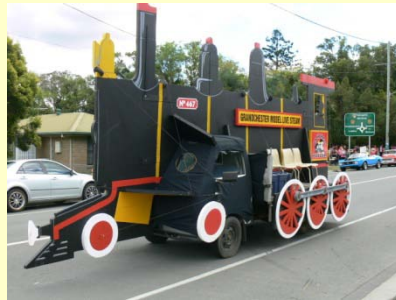
A new Loco