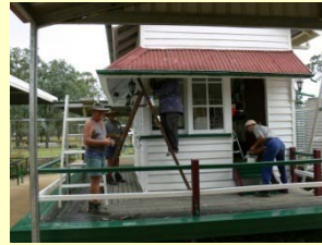
New Paint Job