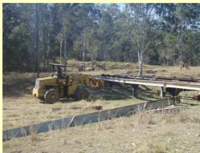
Lets Build a Bridge