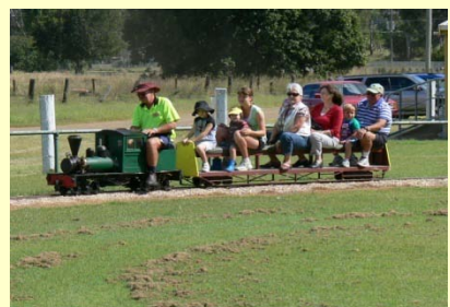
Keep on Steamin on