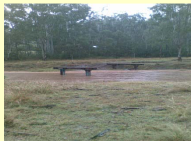
So that's why we built it