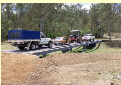
Its not for them.