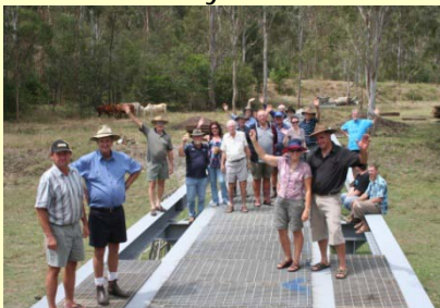
Will it hold the weight