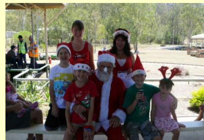
Even Santa Came